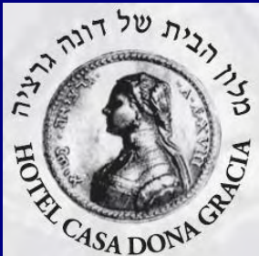
Dona Gracia Hotel

Tiberias / Olive Oil factory / Chocolate factory