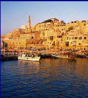
Old Port of Jaffa