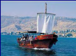
Boat ride on the galilee

Tiberias / boat ride on the sea of Galilee.